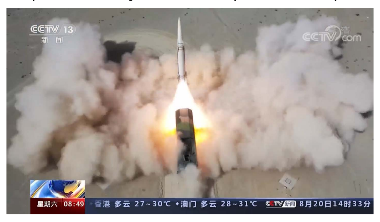
Footage aired by CCTV-13 on 20 August 2021 showing a DF-15 being launched.

This maximum range, as well as the roughly 1000km maximum range of the DF-16, are shorter than the assessed 1400km flight path observed on 13 August. As such, the missiles launched are unlikely to be standard short-range ballistic missiles currently in the PLARF's inventory.